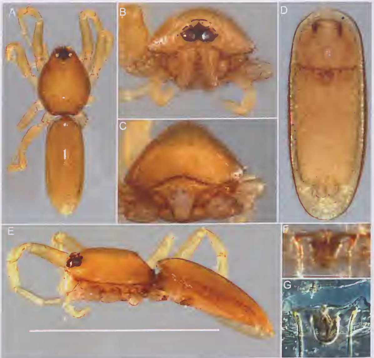
FIG. 4. Cavisternum leichhardti sp. nov., female (allotype PBI_OON 00023703): A, habitus, dorsal view; B, prosoma, anterior view; C, prosoma, posterior view; D, abdomen, ventral view; E, habitus, lateral view; F, female epigyne, ventral view; G, female epigyne, dorsal view. Scale bars = 1.0 mm (Fig. 2E), 0.1 mm (Fig. 2F).